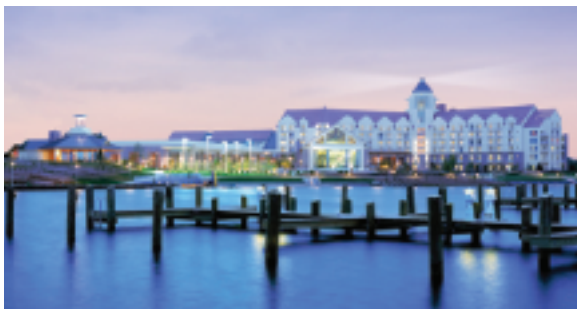
Evening view of the Hyatt Regency

activities, spa treatments, swimming, sailing, fishing, miniature golf, tennis and lots of good food.